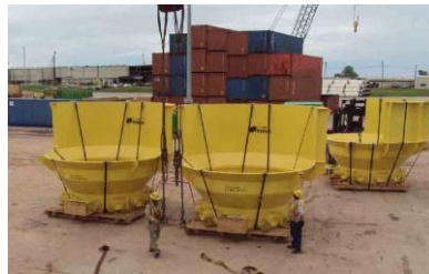
Pile Catcher and Skirt Pile Gripper Weldments Supplied Turnkey

OSI Fixed Platform Systems Group provides patented technologies and over 45 years of proven, reliable service – resulting in confidence for our customers at every step.