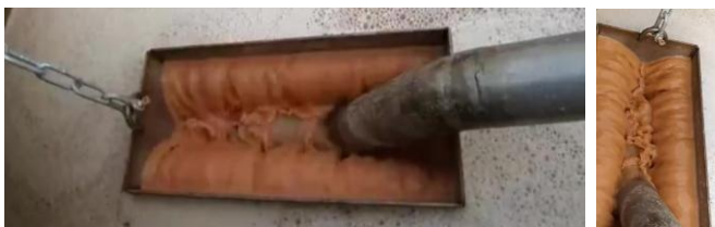
The Floating Double Vortex Suction Device®

Suitable for upstream, midstream, refineries, terminals, and storage facilities.