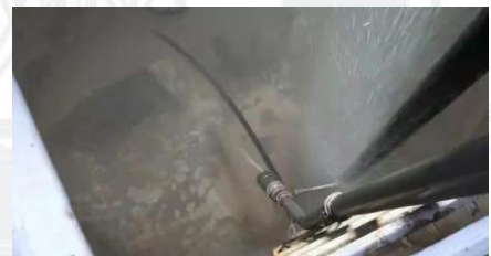
ATC in action