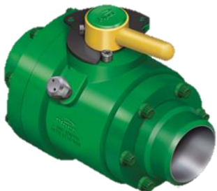
Low-Pressure Compact Ball Valves