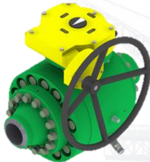
Metal Seated Trunnion Ball Valves