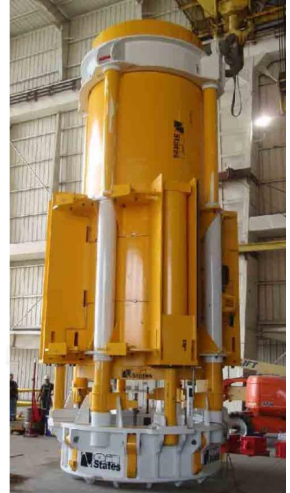
84" X 1750-ton Latch-Lok Leveling Tool