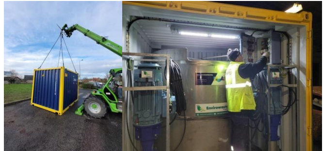
An ATC 'in a BOX'